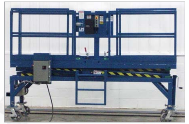
Platform with Roll-outs Retracted