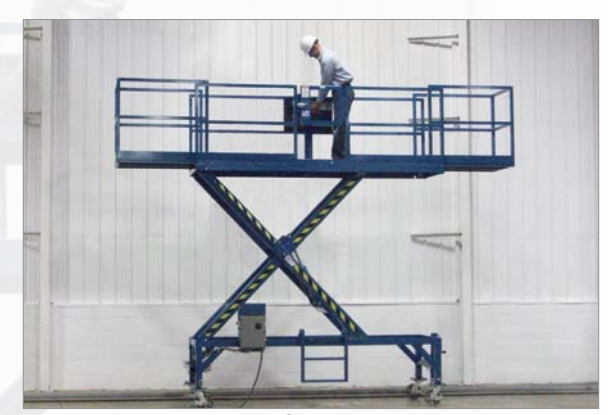
Platform with Roll-outs Extended