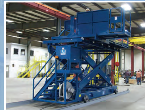
Worker Positioning Platforms