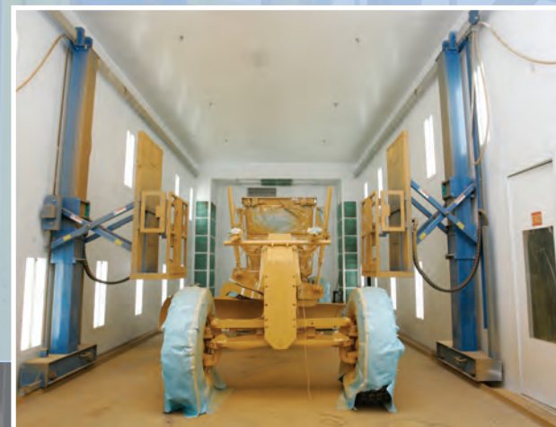
Powder Booth Man Lifts