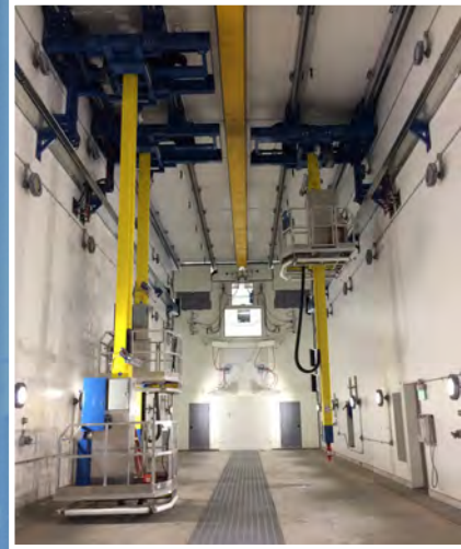
XP Overhead Lifts

Lifts Can be Designed to Fit Your Specific Application