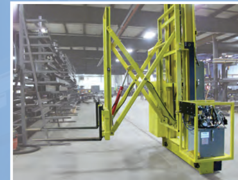
Material Handling Solutions