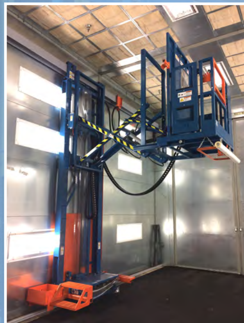
3-Axis Paint Lifts

Flexible Work Environment and Configurations