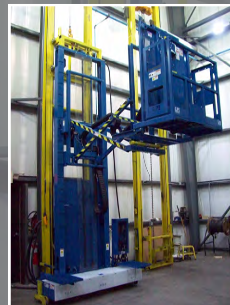
High Solids Paint Lifts