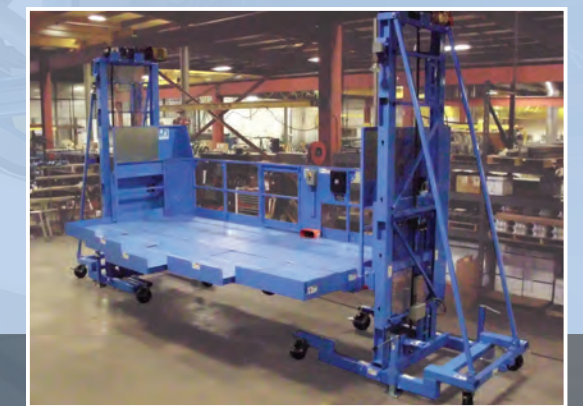
Dual Mast Work Platforms