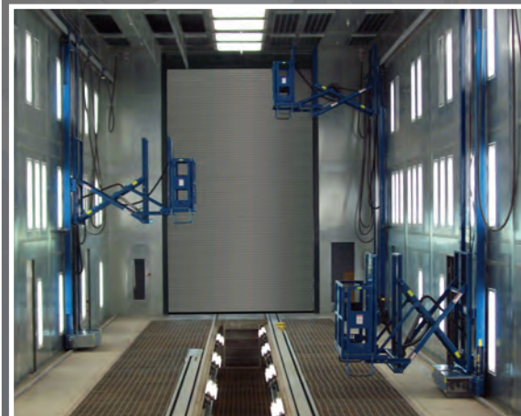
Railcar Paint Lifts