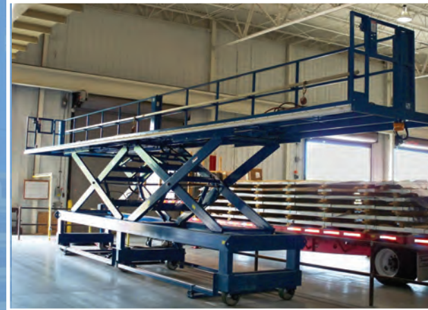
Flatbed Access Platforms