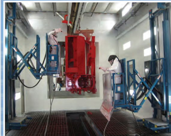
Paint Lifts - Electrostatic Process