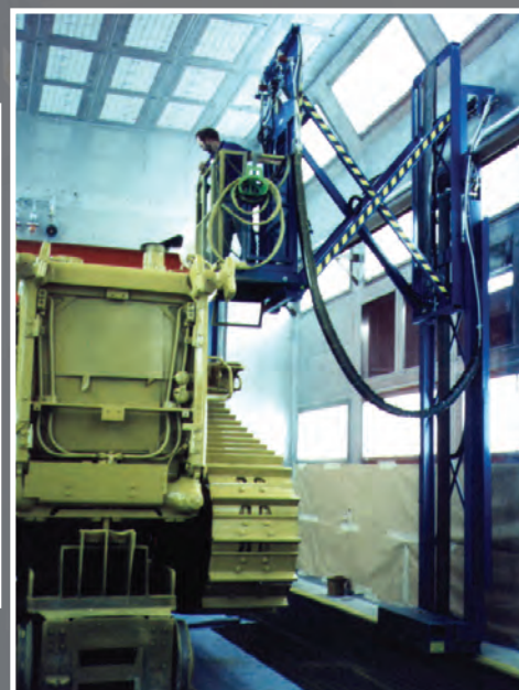
Equipment Access Lifts