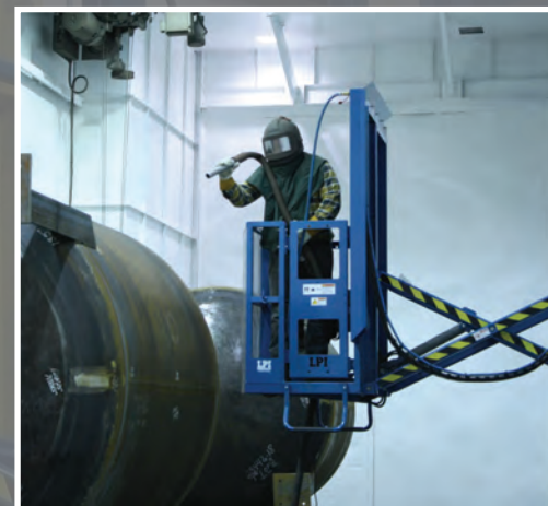
3-Axis Blast Booth Lifts