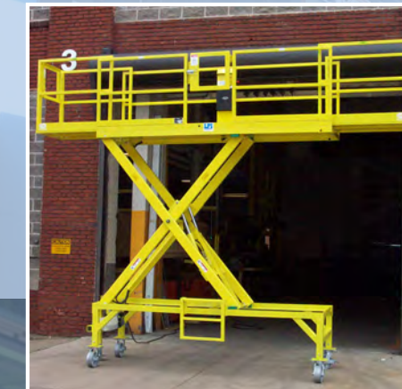
Manually Positioned Work Platforms