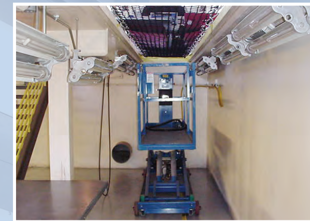
Maintenance Pit Lifts

Access, Positioning, Inspection, and Ergonomic Platforms