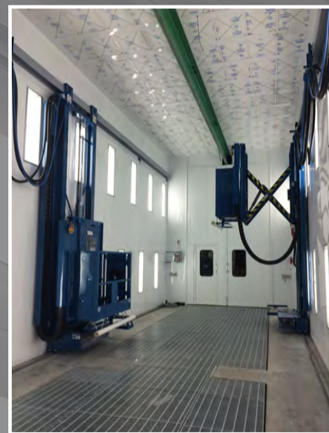
Wash Booth Lifts