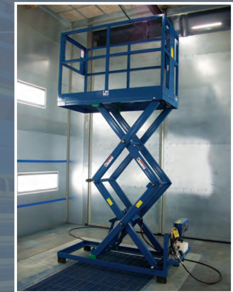
Stationary Scissor Lifts