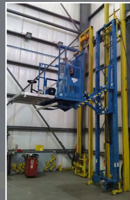
Welding Lifts with Tip-Down