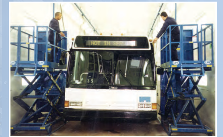
Rail Guided Scissor Lifts