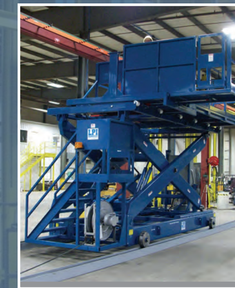
Large Work Platform with Side Shift