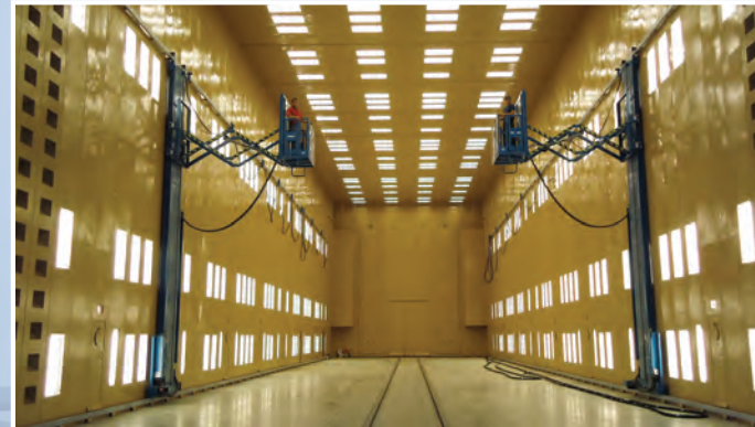
Extended Reach Blast Booth Lifts

Lifts Can be Designed to Fit Your Specific Application