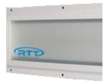
Industry-leading LED lighting